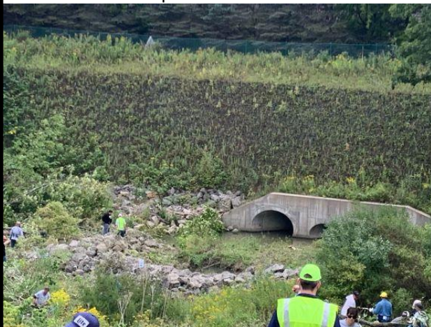
Miller Coors/ Sweet Water Clean-up project!