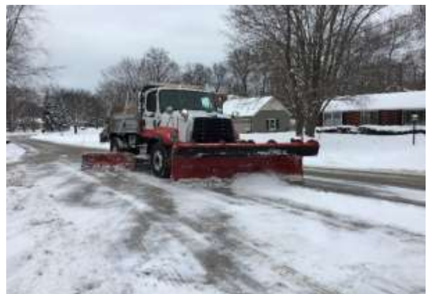
Snow Plow Operation