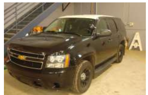
Squad 2102 Decommissioned for Auction