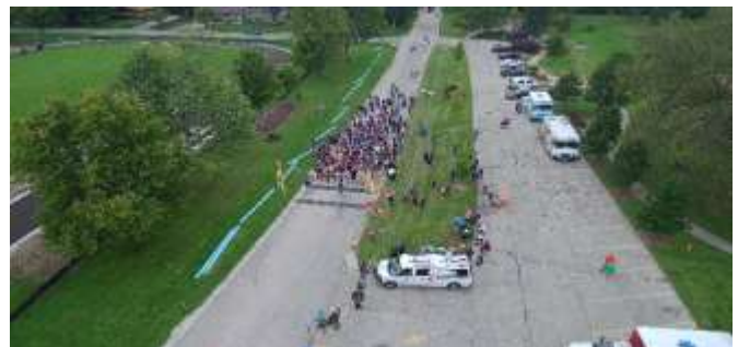
2018 5k Run/2 Mile Walk – Brown Deer Drone