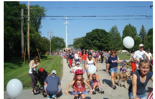
4 th of July Parade