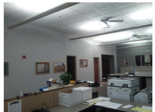
Village Hall Painting Project